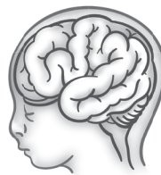
39 to 40 weeks