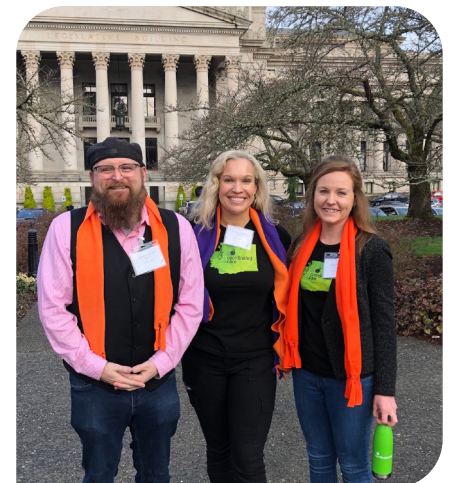
Coordinated Care staff support our partners in Olympia